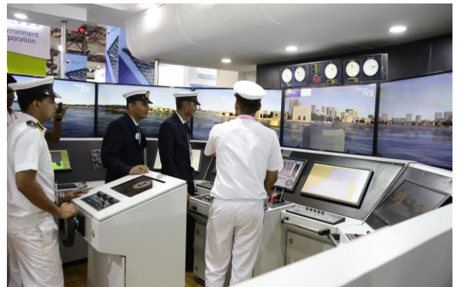
Full Mission Ship Manoeuvring Simulator at the DGS Stall