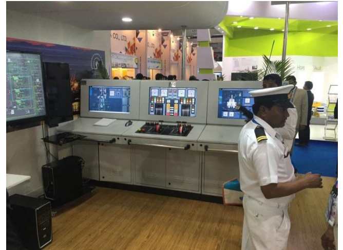
ARI Engine Room Simulator with interactive 3D Engine Room