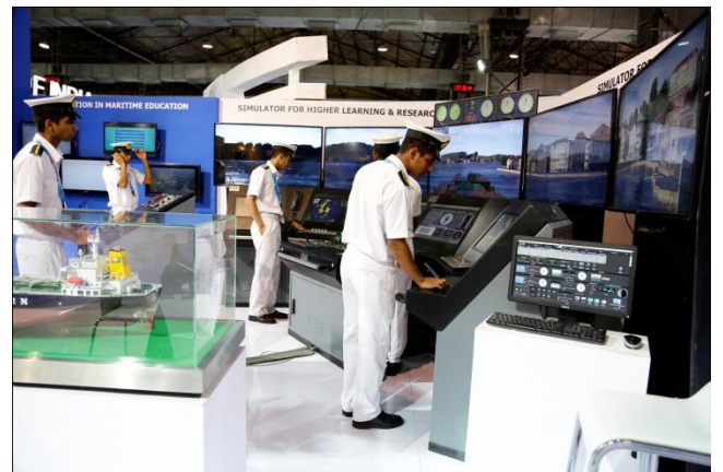
Indian Maritime University Stall: "Simulators for Higher Learning and Research"