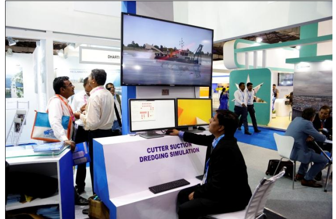
Showcasing the Inland Navigation and Dredging Simulator on behalf of IWAI