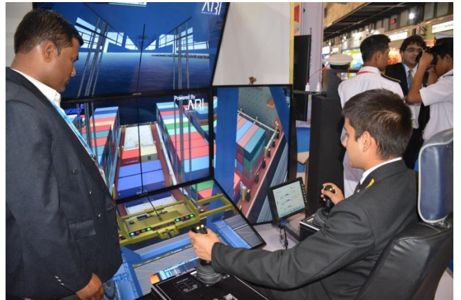
Crane Simulator for DP World