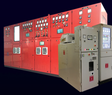
FULL MISSION HIGH VOLTAGE SIMULATOR