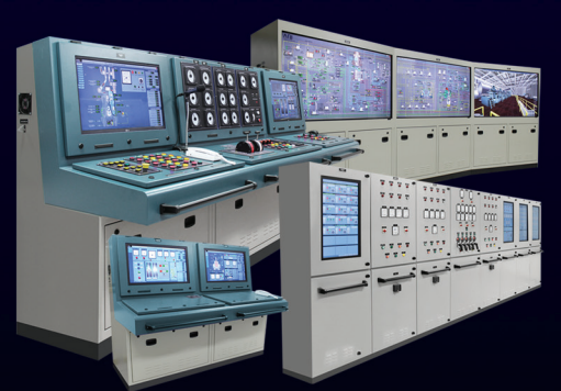
FULL MISSION ENGINE ROOM SIMULATOR